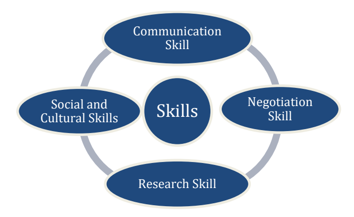
Figure 1. Skills of an education diplomat (CED, 2021).

Furthermore, education diplomacy could be regarded as a crossroads of diplomats and education professionals. Because of this, unique set of skill should be obtained by the practitioners. Communication, cooperation, initiative research, social and cultural skills, as well as foreign language development are among the diplomatic skills that education leaders need to develop so that they can contribute education diplomacy. In this regard, Figure 1 illustrates the main categories of skills an education diplomat needs to possess.