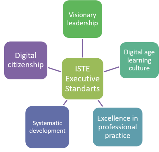
Figure 2. Dimensions of ISTE executive standards

Today, as a leader in education, the use of information technologies and digital leadership skills of school administrators have become more important. Standards have been developed to measure the technological leadership requirements that school administrators should have. As shown in the Figure 2, the National Educational Technology Standards for Administrators (NETS-A), developed by the International Educational Technology Society (ISTE) in the USA, includes six dimensions (ISTE, 2009). These standards are also considered as digital leadership standards (Şahin et al., 2020). This standard can guide school administrators in improving digital teaching. Here, it can be seen that digital leadership is considered as five dimensions: visionary leadership, digital age learning culture, excellence in professional practice, systemic improvement and digital citizenship. In this context, it is emphasized that leaders should allocate time and continuous training to teacher competencies and contribute to their development in order to minimize the problems.