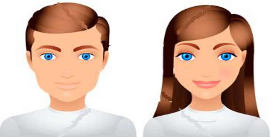
Figure 1. Images of woman and man in the materials

As shown in picture 1, images of woman and man are gender-neutral to ensure that children are not biased according to clothes or physical characteristics.