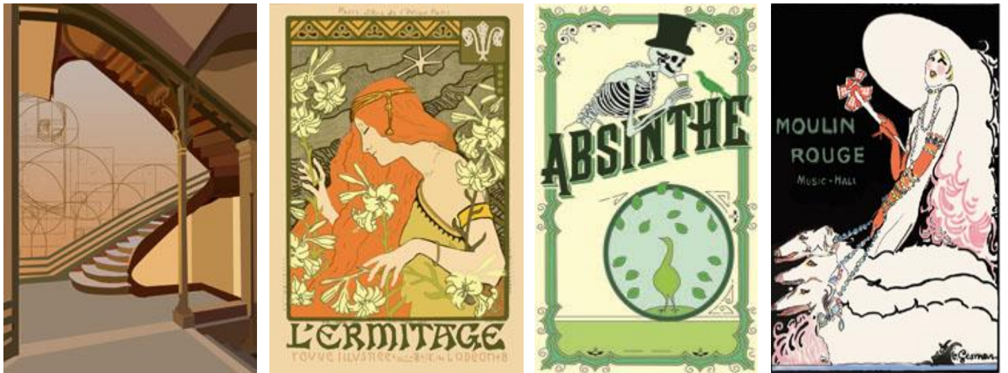
Figure 2. Sample digital drawings created with Photoshop and Illustrator