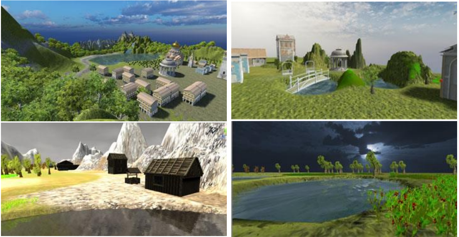
Figure 4. Game scenes developed with the Unity game engine