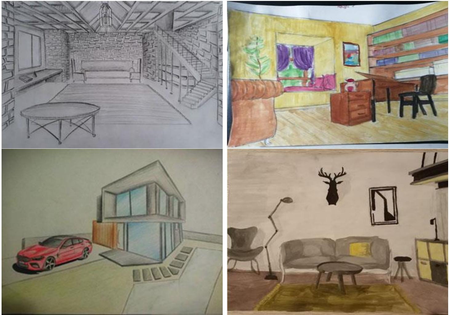
Figure 1. Hand drawing concepts on paper with charcoal, dry paint and watercolor

developed a game environment that they designed in their minds with the Unity game engine (Figure 4). Students have experienced the happiness of being able to navigate in the environment they have created in the Unity game engine. Thus, the course activities have been made more fun and learnable. Students walked around in their own project as if they were playing a game. Students took great pleasure in their work and became more willing to engage in course activities.